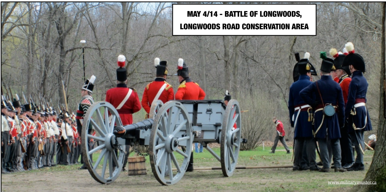
MAY 4/14 - BATTLE OF LONGWOODS, LONGWOODS ROAD CONSERVATION AREA