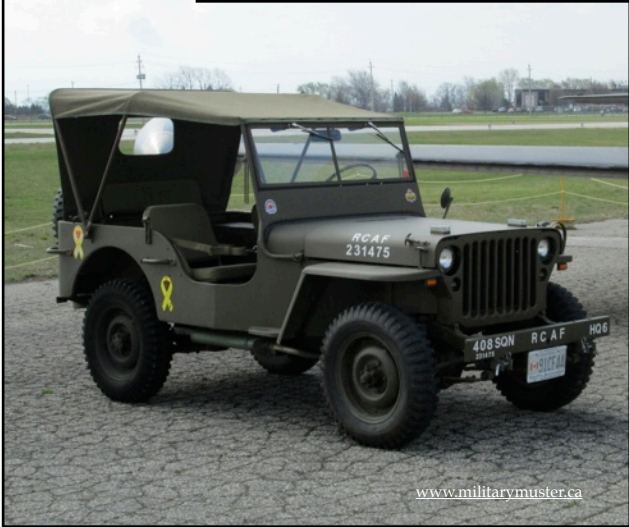
MAY 3/14 - WINGS AND WHEELS, WINDSOR AIRPORT