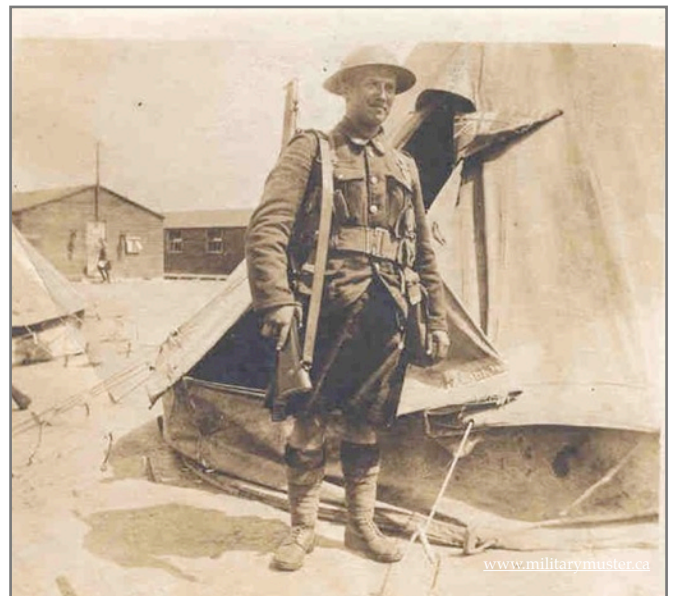
Above: West Sandling camp, England, summer 1917