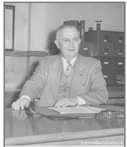
1950s picture - he is wearing his "Service at the Front" pin