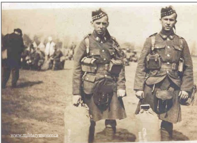
Above: Grandfather and unidentified soldier at assembly area in Windsor before getting on train to go overseas in 1917

241st BN CEF Canadian Scottish Borderers