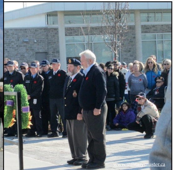
LASALLE - NOVEMBER 11TH